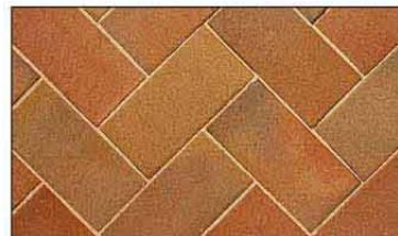
Hadley Red Brindle