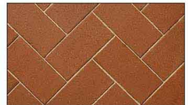
Hadley Red Mixture