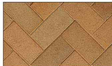
Harvest Buff Brindle